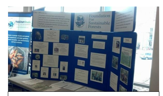
Tabling, speaking and educational programs were numerous in 2014.