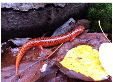
October in the Foundation's Blooming Valley Forest