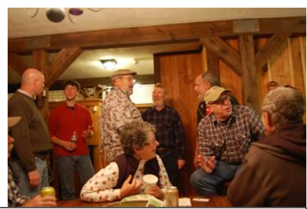
The first-ever Forest Fest Indoor Potluck Picnic held Nov. 8, 2014 at Woodland Lodge was a rousing success bringing together dozens of forest lovers to share good food, good music and a commitment to sustainable forestry and protection of forested land.