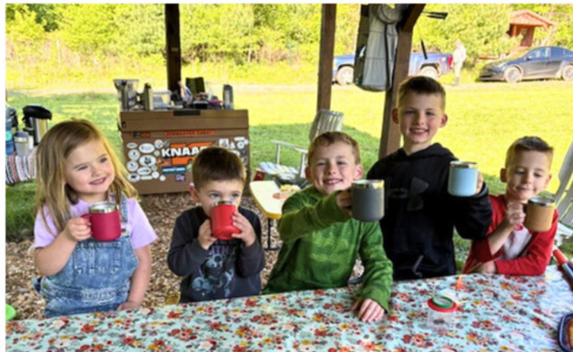
The third generation celebrates The Land with a hot chocolate “Cheers!”